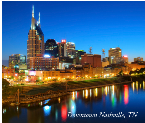
Downtown Nashville, TN